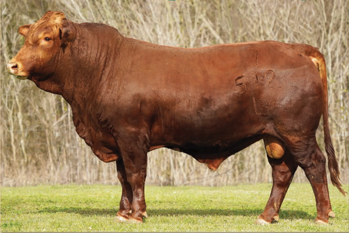
Owned in partnership with HH Holmes Ranch