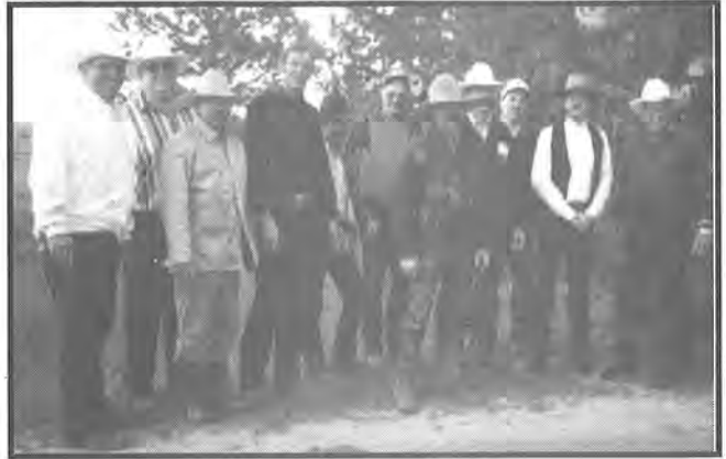
The whole crew after a partial clean up effort.