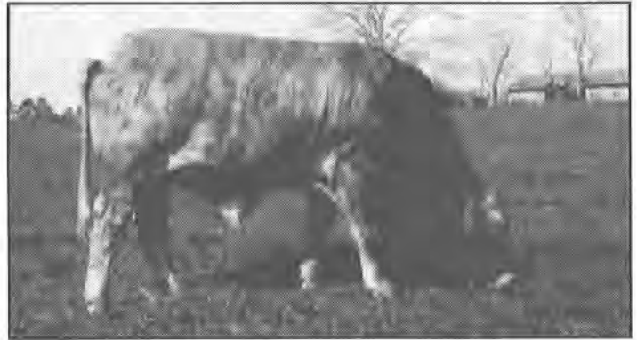
War Eagle 6 consigned by War Eagle Beefmasters was high selling bull at $1,700.00