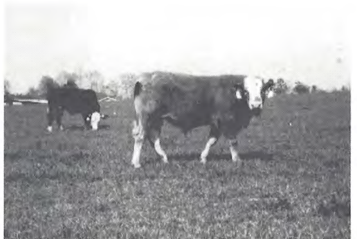
Gowan 132 had the 3rd highest weight per day of age of the 135 bulls tested on the South Mississippi Forage Test. The bull gained 2.40 lbs. per day for life on grass.