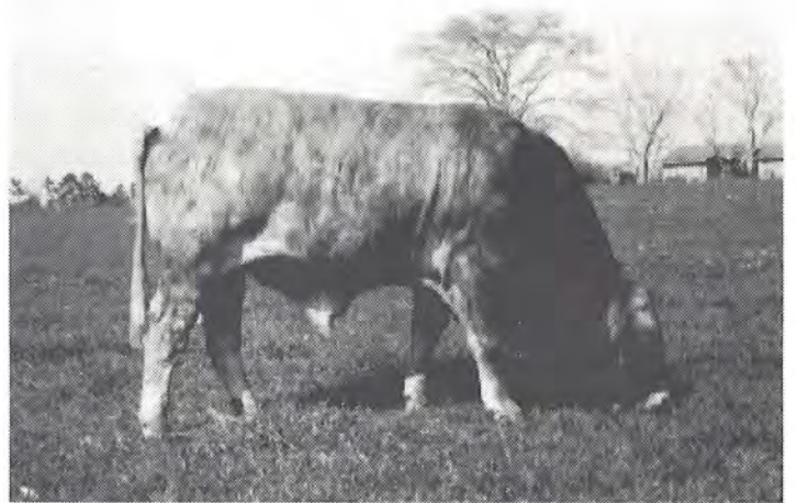
War Eagle 6 ranked 15th on the South Mississippi Forage Test with a gain of 355 lbs. He ranked 17th on weight per day of age. He had the 5th largest scrotal circumference and second largest pelvic area.

Wallace 231 ranked 7th on gain and 7th on weight per day of age. War Eagle 6 ranked 15th on gain and 17th on weight per day of age. He had the 5th largest scrotal circumference and shared 2nd largest pelvic area of 208 cm 2 (13x16). Gowan 132 had the 3rd highest weight per day of age of the 135 bulls tested.