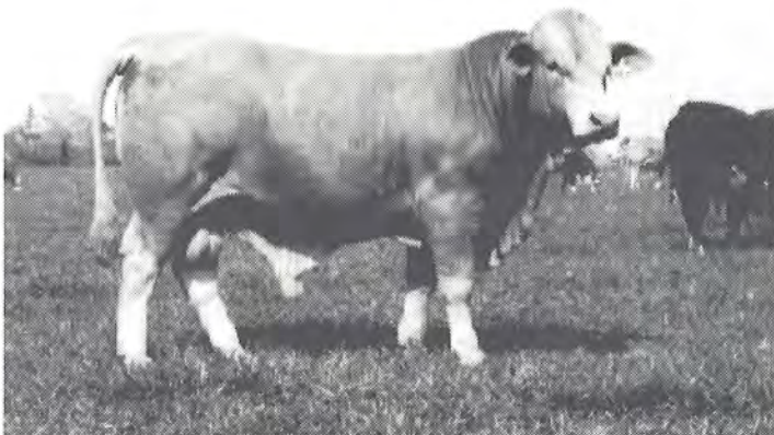
Wallace 203 ranked 6th on the South Miss Forage Test with a 140 day gain on grass of 380 lbs. The bull ranked 11th on weight per day of age, 1st on scrotal circumference and second on pelvic area.