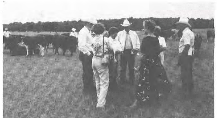
Visiting the bulls