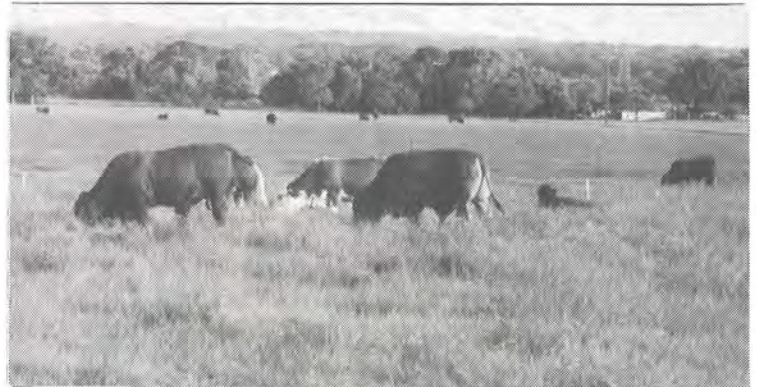
Some of the 130 bulls on test.