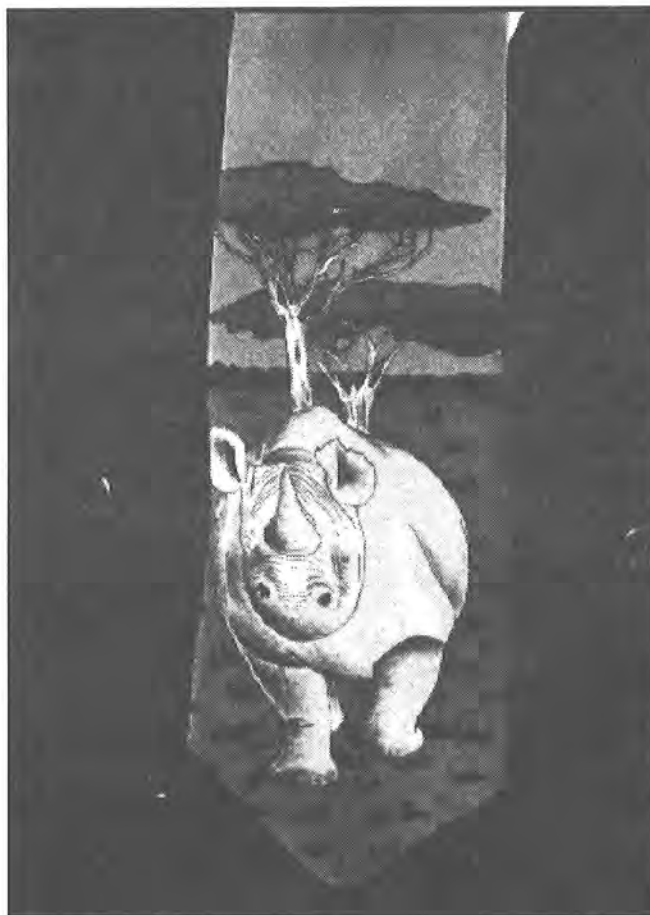
Who wore this neck tie at the FBA convention?