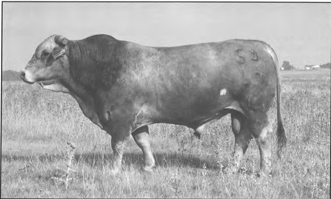
Lasater herd sire 5367