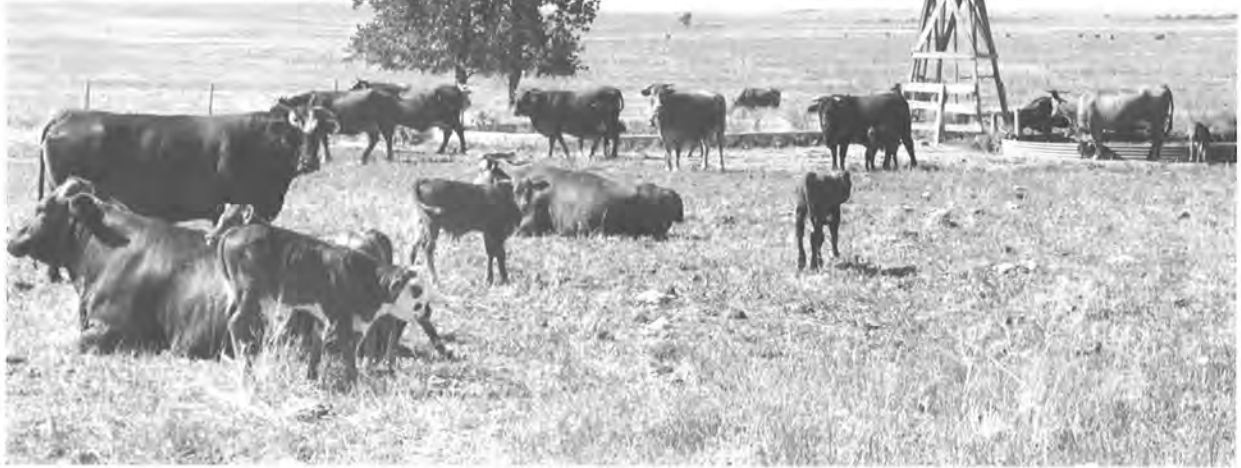
Pairs in Canyon Pasture

Dale Lasater: (719) 541-BULL or Evenings: (719) 495-3432 Duke Phillips: (719) 948-2289