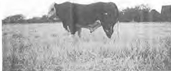
Lasater bred Bosch herd bull.

The field day held one week ago today was one of the outstanding events in which I have participated. It was at Pieter's sales pavilion on the ranch with significant numbers of good cattle on display. The panel consisted of top