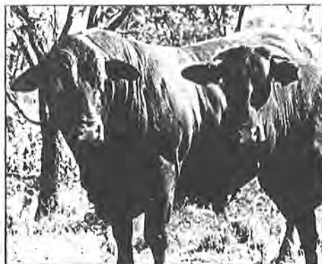
Casey bull with a Johnston-bred cow.