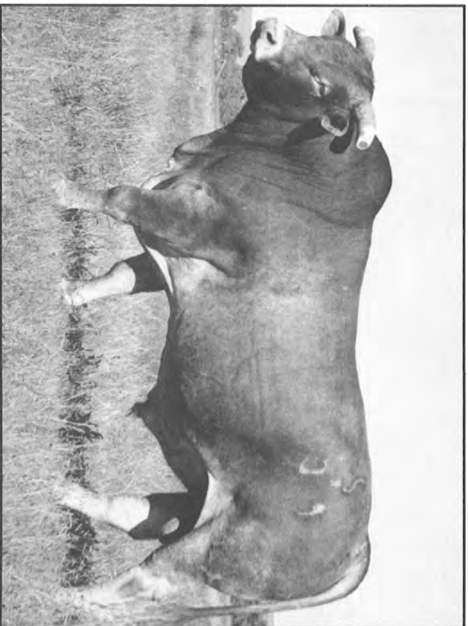
Unretouched Range