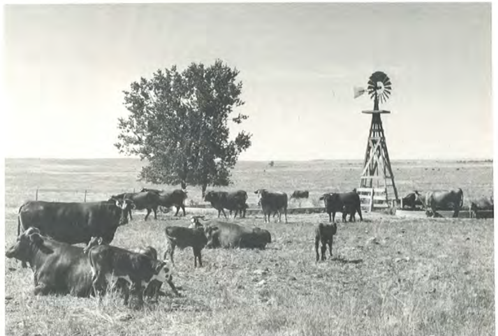
Pairs in Canyon Pasture