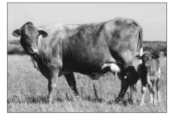
14-year-old cow with her fifteenth calf