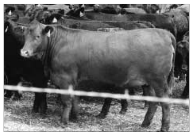
L Bar 5502 X Angus heifer on feed