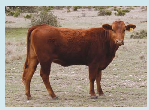
12 Fall-calving bred Beefmaster heifers from Vista herd