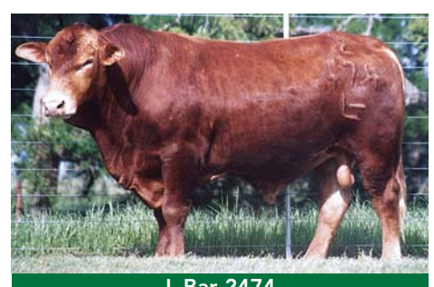
L Bar 2474 BW 0.1 WW 10 YW 19 TMAT 9 SC -0.2 Polled