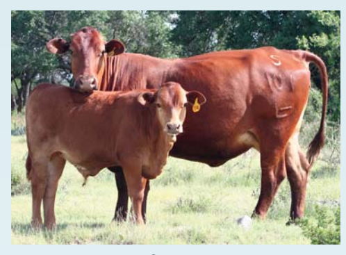
16 Beefmaster pairs All calves by AI bulls (10 heifers and 6 bulls)

18 Beefmaster yearling heifers Ready to breed (L Bar and Vista genetics)