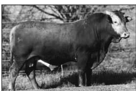
L BAR 7499