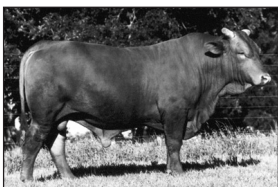
L BAR 8419