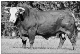
L BAR 5502