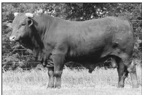
L BAR 7303