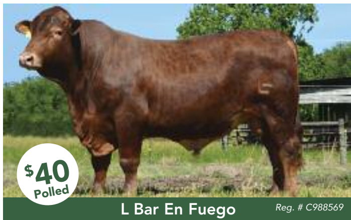
BW -1.1 WW 20 YW 25 MILK 4 TMAT 14 SC 1.3 REA -. 04 IMF .1