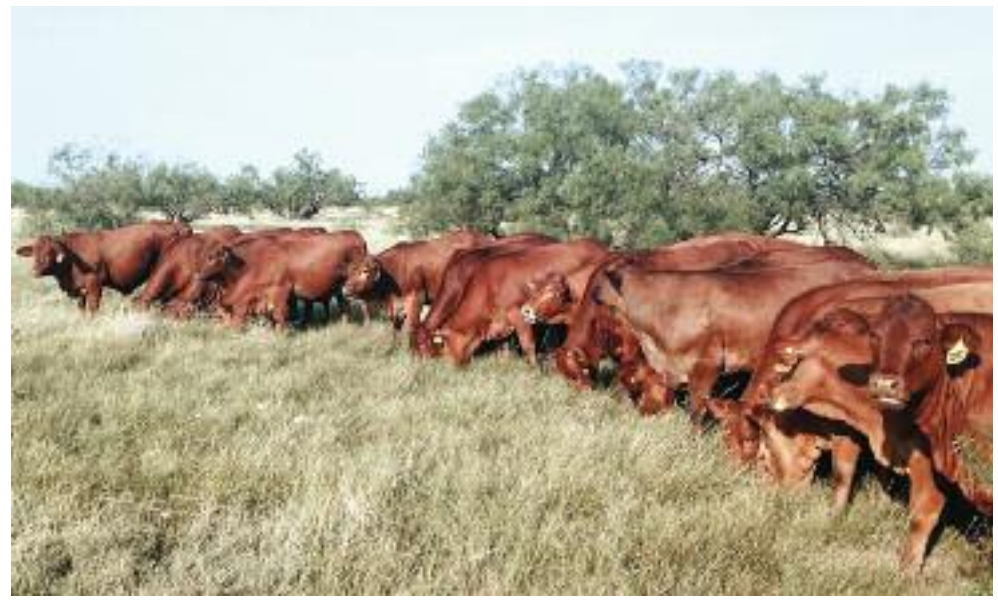
Beefmaster females are the key to the breed's profitability: They are able to wean high-quality calves annually with very little help.

The Isa Beefmasters advertising theme this fall has been "Why Beefmasters?" It's an important question because these wonderful cattle often don't get enough credit for all the subtle things they do so magnificently. Following are a few of the things that make Beefmasters truly unique in beef cattle production.