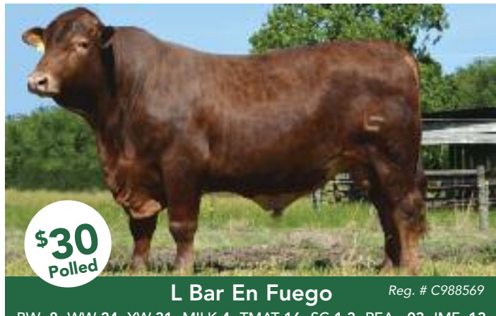
BW .8 WW 24 YW 31 MILK 4 TMAT 16 SC 1.3 REA -. 03 IMF .13