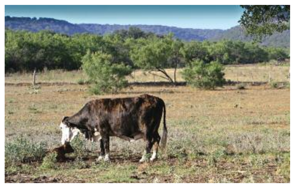
Cookie nuzzles her adopted calf.

In July, if you will remember, she was in a small trap. We had an abandoned calf last summer and put this (blind at the time) calf in with Cookie for company. Cookie's mothering instincts kicked in immediately. She assumed the nurturing role in every way possible, except milk, of course, which we provided. She cooed that low guttural motherly coo to the calf, which the calf would come to, and they bonded immediately. She was a mother cow to the end. I pulled her out of the barn area tonight, and to a place about a quarter