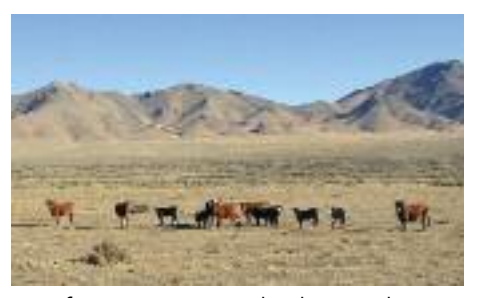
Beefmaster cows and calves making it work in the Nevada desert