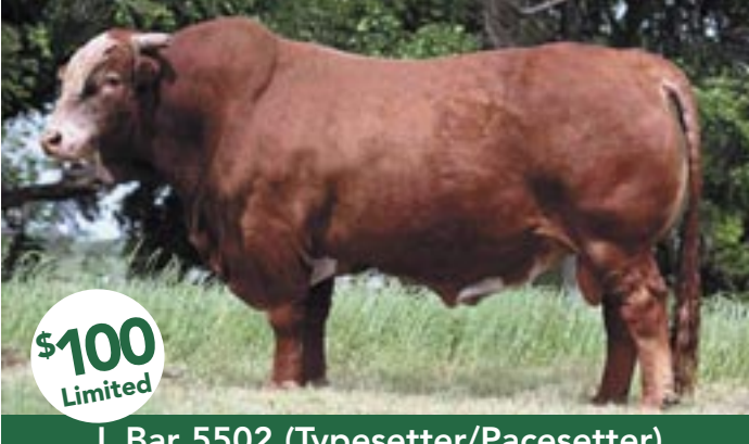
L Bar 5502 (Typesetter/Pacesetter) BW 1.3 WW 39* YW 53* MILK -24 TMAT -4 SC 1 REA .3 IMF 0 RFAT -.1