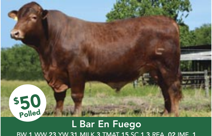
BW 1 WW 23 YW 31 MILK 3 TMAT 15 SC 1.3 REA .02 IMF .1