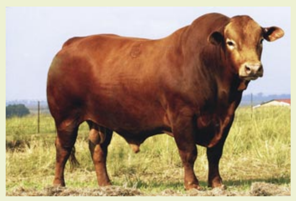
Manjoh Ranch of South Africa is producing some great registered Beefmaster cattle, as witness this excellent bull above, MAJ 07-0622, an Al son of L Bar 3432. L Bar 3432 is the top marbling bull in the Beefmaster breed.