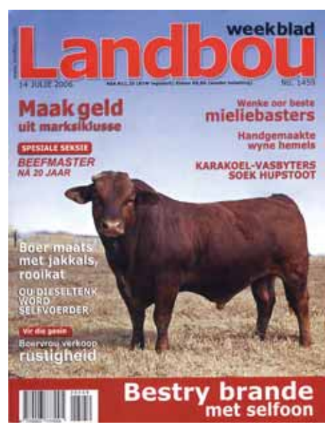
An L Bar 7499 son on the cover of South Africa's leading cattle publication

Congratulations to the South African Beefmaster Association on 20 great years and, more importantly, on becoming the third-largest breed in the nation!