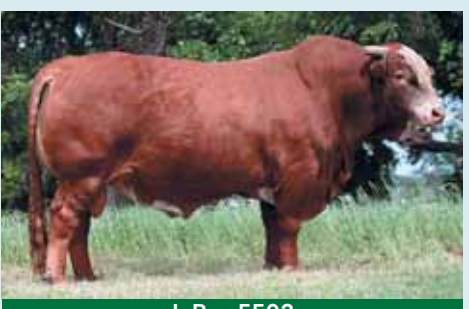
L Bar 5502 BW 1.6 WW 30* YW 42* TMAT - 8 SC 0.4*