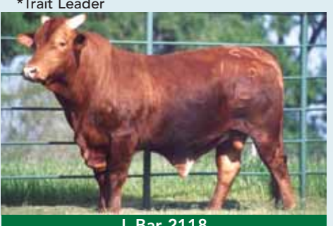
L Bar 2118 BW -0.5 WW 15 YW 17 TMAT 12 SC -0.3